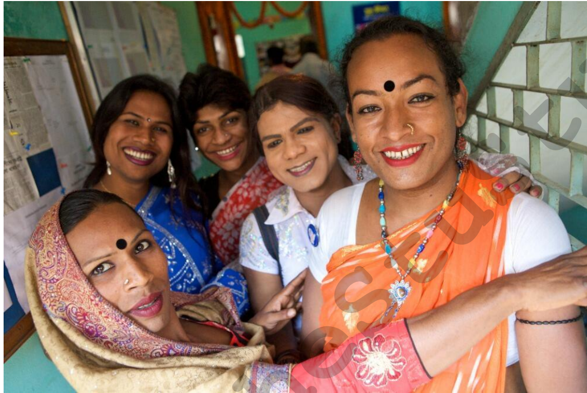
A group of hijra in Bangladesh in 2010, by USAID Bangladesh, Wikimedia Commons: http://bit.ly/2w0PINE